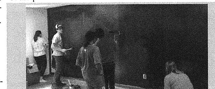
LIFETEEN crew painting a chalkboard wall for the LIFETEEN Room!

Thank you for supporting the LIFETEEN Bake Sale, which raised $746, and the Catholic Eagles sale, which raised $353.00